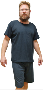
YSHIELD® TBT + TBH